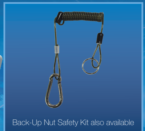
Back-Up Nut Safety Kit also available